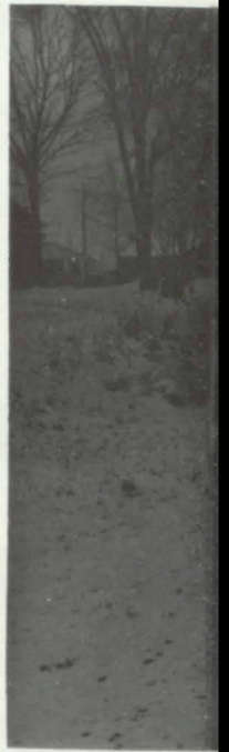
HERE'S A LANDMARK that will always be one step above the rest. "ASHLEY BEARS" is proudly displayed on the highest structure in town.